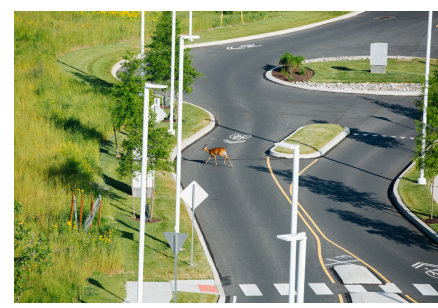
The campus attracts wildlife, including deer.