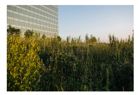
Landscape architects say more clients are asking for design solutions to address climate change.