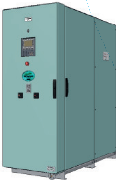
NC 1.1 Compact Nitrogen Cabinet

An easy-to-understand, solid-state, LED user interface is integrated into the front panel where the operator can access all status signals, process parameters and alarms. There is also the option to interface the unit directly into ships IAS using a standard serial communication (MODBUS) connection which eliminates multi-core cables. The NC 1.1 system will even remind you about routine maintenance and provide instant access to our service and parts department for simplified ordering.