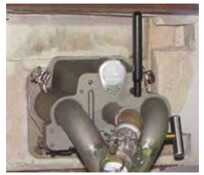
Figure 2: HR<sub>o</sub> burner installed in a glass plant.

depending on the furnace environment. Since the burner is battery-powered and communicates wirelessly, once installed, the burner data are immediately accessible both locally and remotely.