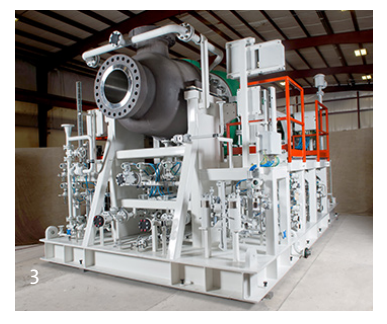
Equipment built at Air Products' manufacturing facilities: