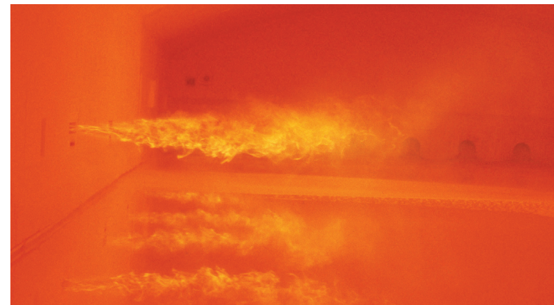
Figure 2: Air Products' Cleanfire HR, burner has a wide flame and oxygen staging.